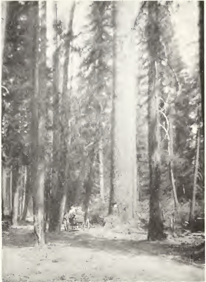
Figure 6. Travelers on the old Crater Lake Road between Prospect and Union Creek, circa 1910.

Stock-raising was nearly as important to the early local economy as was mining. The two were actually complimentary; the ranchers found a nearby market and the prospectors were supplied with beef. During the 1860's and 1870's, thousands of head of Rogue Valley stock were trailed over the Cascades to help begin the cattle empire of Eastern Oregon (cf Oliphant, 1968). Local cattlemen continued to graze their herds in what is now Rogue River National Forest but sheep-grazing had become increasingly important by the late nineteenth century. In some instances, this represented a reverse flow from Eastern Oregon. Sheepmen from the Prineville-Silver Lake area grazed their flocks on the high meadows of the Southern Cascades (Bartrum, 1918, P.58 and Crater N.F., Grazing Atlas, 1923).